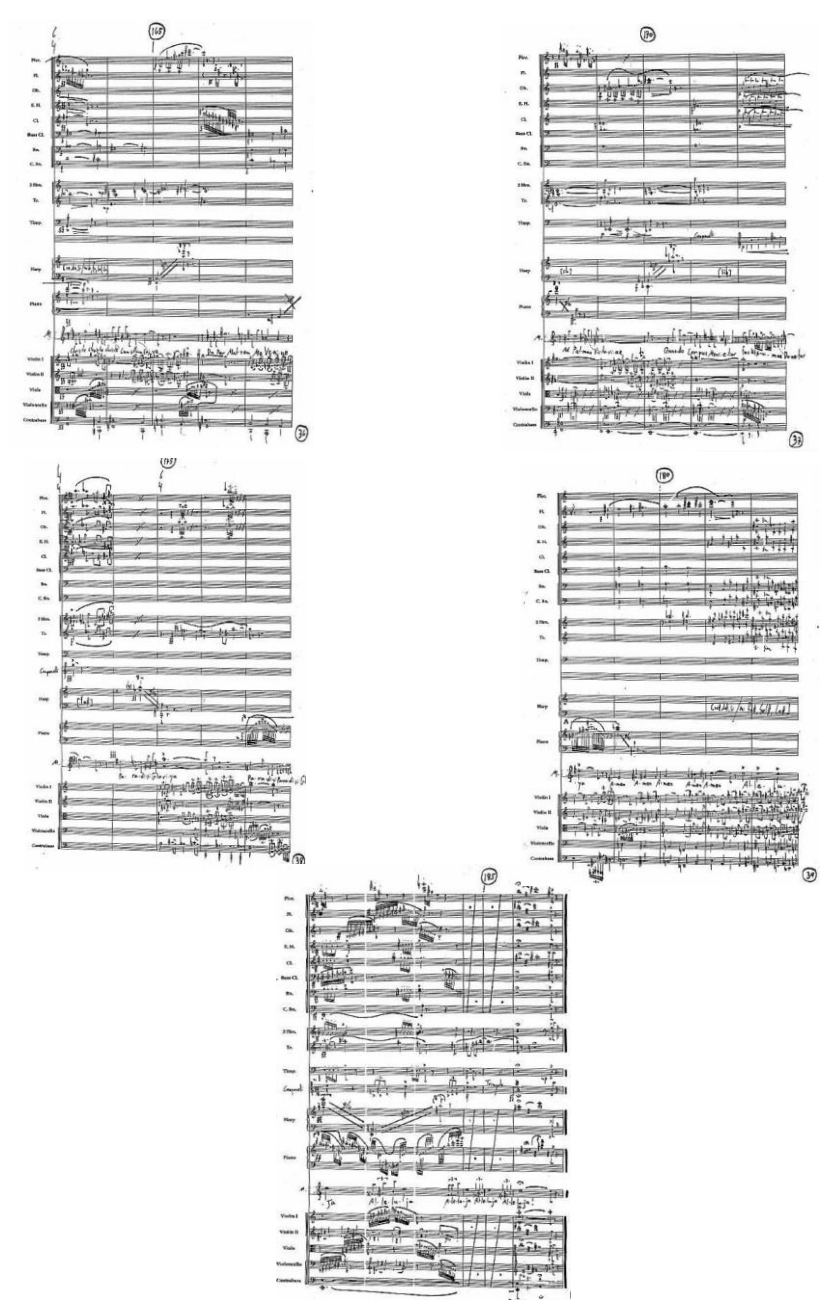
Five pages from the manuscript of the Finale of Stabat Mater