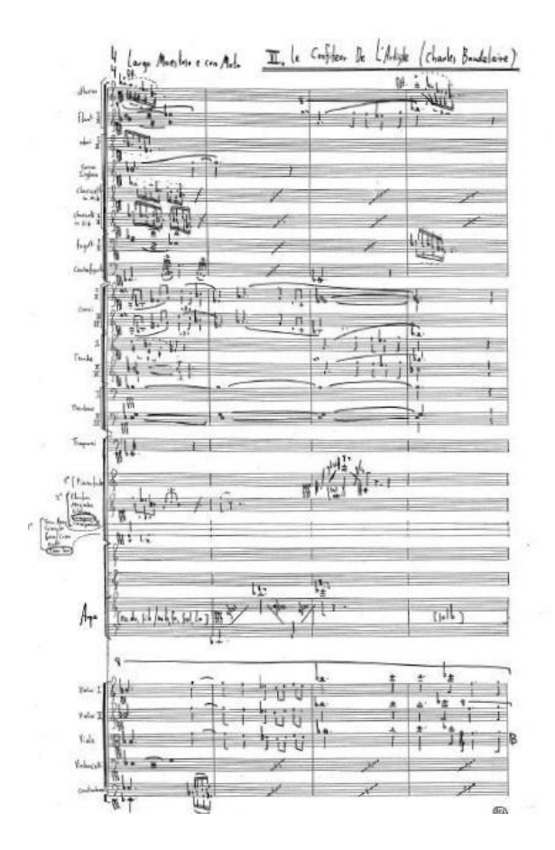
Page from the manuscript of the Cantata of Ecstasy – Symphony no. 6