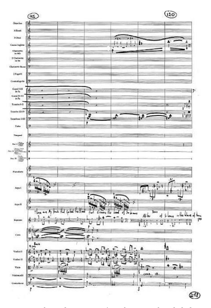
Page from the manuscript of Songs of Bathsheba